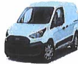
View All Media